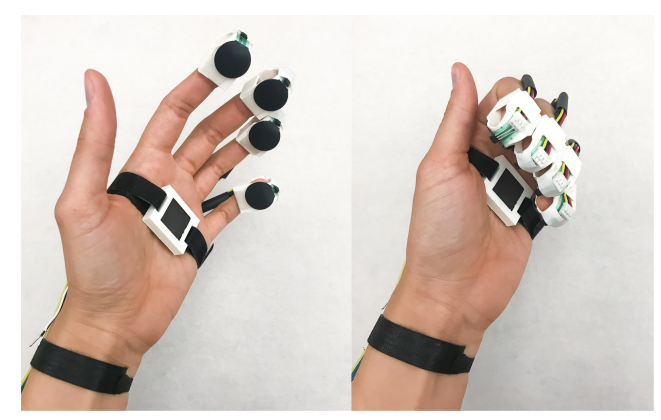
(a) The hall effect sensors and the magnet placed on the palm allow detecting first closing and opening gestures.

All the modules are prototyped by 3D printing the sensor enclosing and base structures. The accelerometer and magnets are embedded during the 3D printing process. This approach called the hybrid additive manufacturing method exceeds the scope of this paper [15]. Its application for musical instruments is discussed as part of another research. For this initial prototype, we used a Teensy 3.5 controller for its number of analog input options, a three-axis accelerometer,