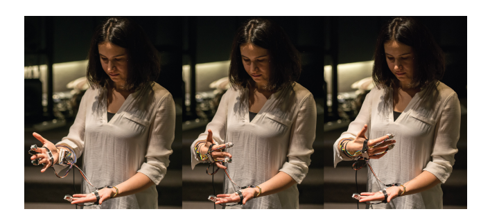
Figure 5: ASL music gesture creates beating effects with waving the hand captured through accelerometer worn on the right hand.

categorical components from speech-plus-gesture and imagistic components from gestures [9]. On the other hand, we observe that musicians, too, adopt gestures' functionality and communicative and expressive components [7]. Like in music, the gestures in sign languages appear intuitively to understand and express. From language to music performance, gestures from numerous domains overlap in expression, functionality, and communication. In Felt Sound, we explore the expressive and communicative nature of gestures—not limited to their meanings—by adopting movement into DMI performance. Our main purpose is to draw the performer's focus to bodily movement with an unconventional gestural vocabulary.