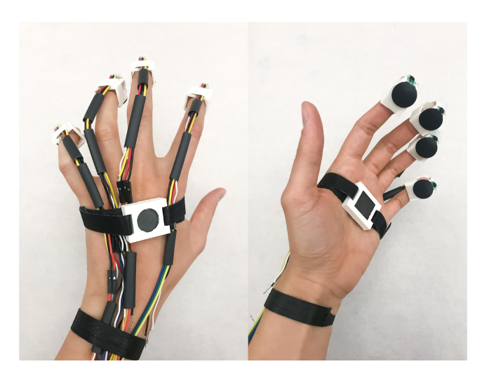
Figure 2: The prototype of Felt Sound's interface

sounds designed to produce physical sensations (as output). This work borrows from American Sign Language (ASL) gestures, potentially with or without their overt meaning.